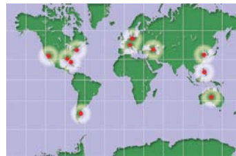
GLN SP Stations